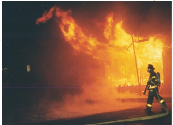
CHIEF JOHN NORMAN

Fires in stores & other commercial occupancies are severe threats to firefighters. More firefighters are killed per alarm in commercial fires than any other fire. Fortunately store fires are not everyday affairs, but as a result many dept's try to apply "House Fire Tactics" to store fires, with disastrous results. This class highlights the difference between house and store fires, and illustrates tactics that have proven effective in dealing with these killers, including the firefighter trap: cellars.